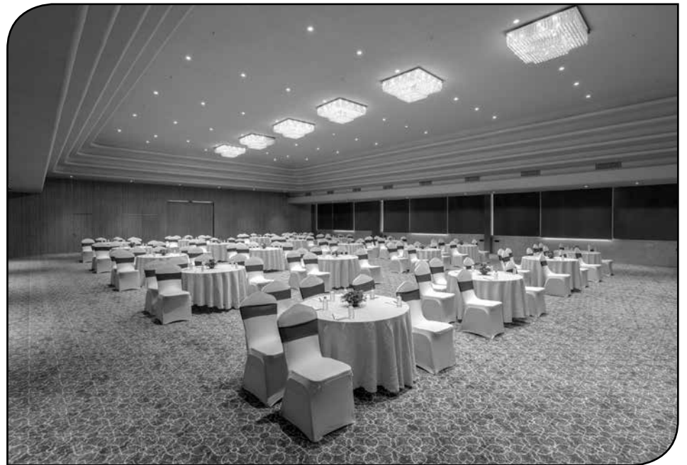
SAMMROH - BALLROOM