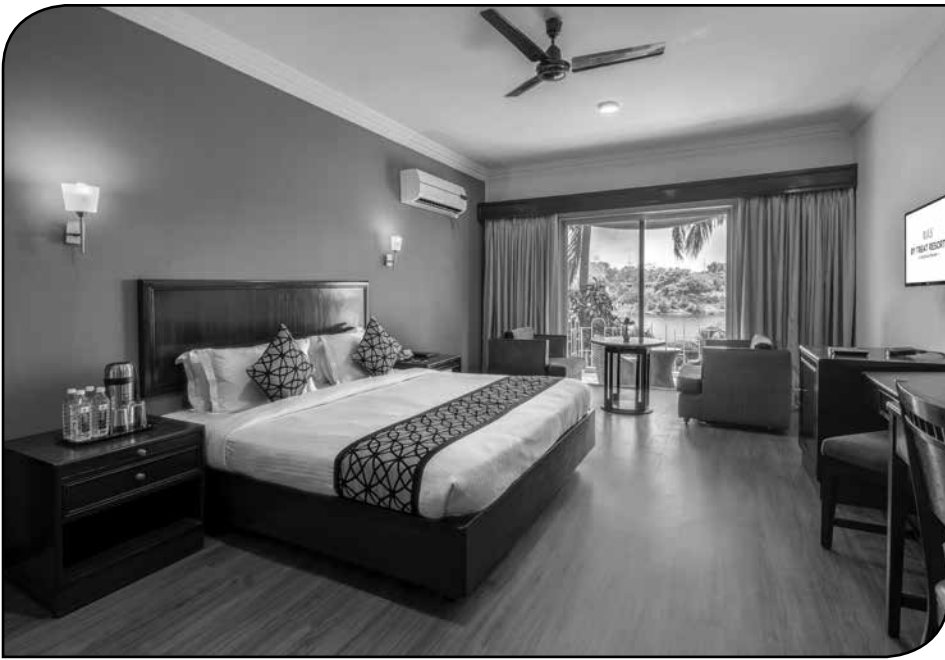
EXECUTIVE ROOM - RIVER VIEW