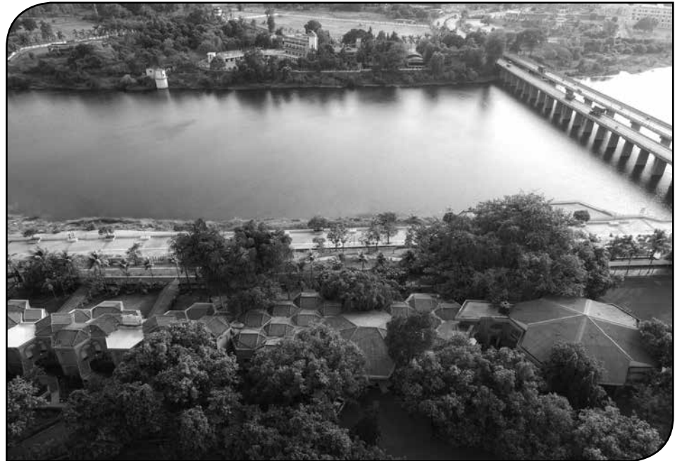
ANOTHER AERIAL VIEW OF RAS BY TREAT