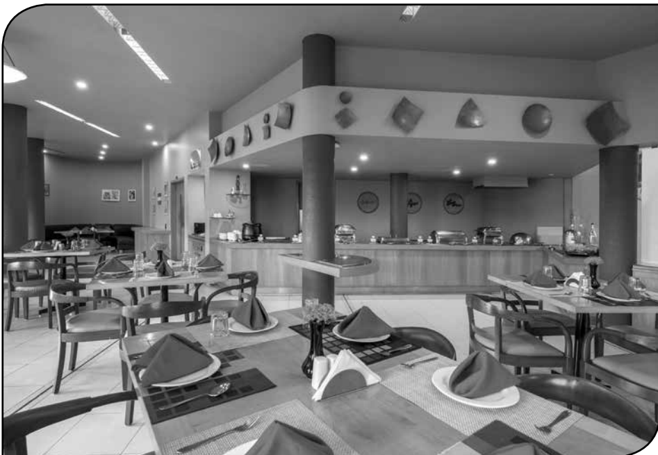
BISTRO THE FEAST VILLAGE