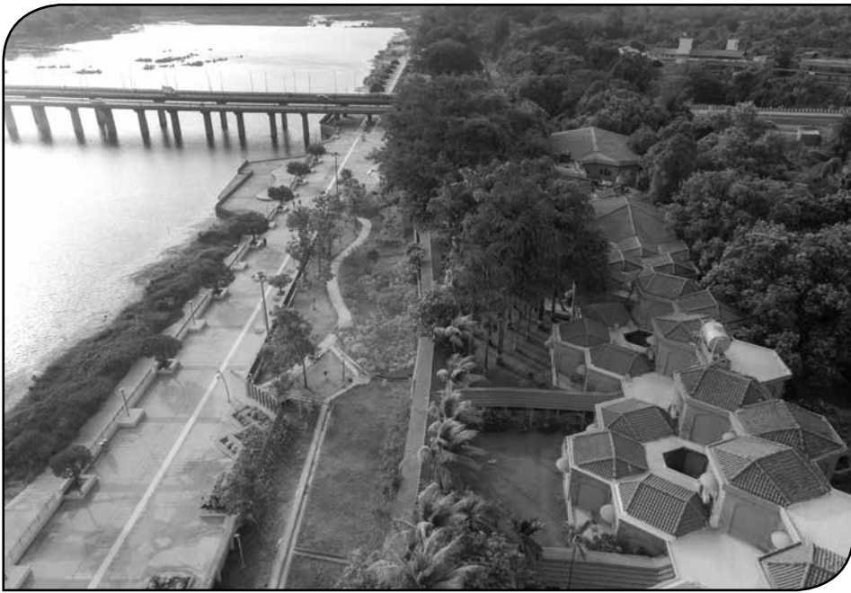
RAS BY TREAT-AERIAL VIEW