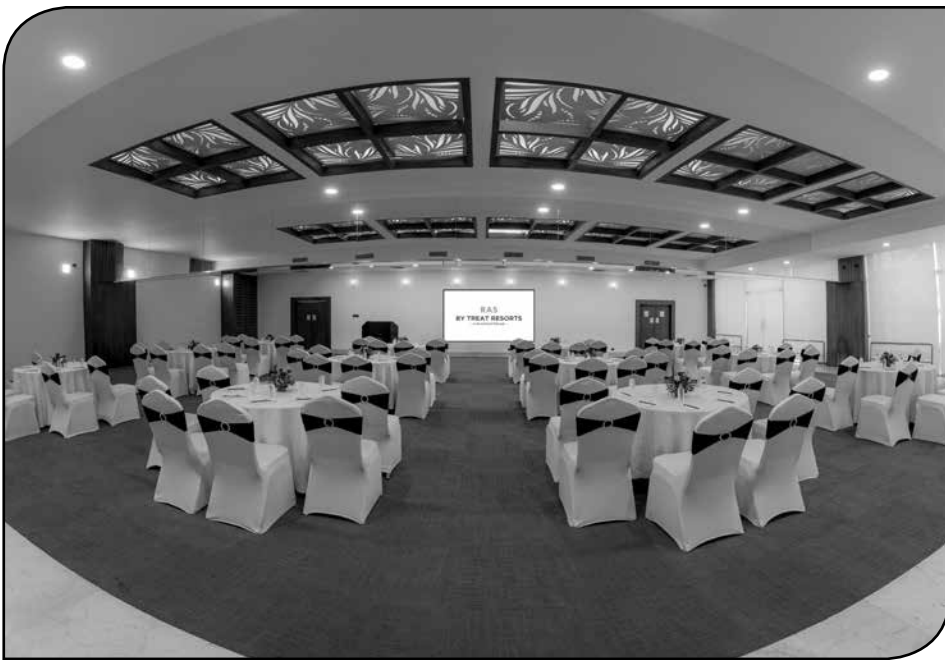
SAMMELAN - BANQUET HALL